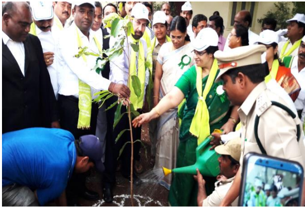
Haritha Haram Plantation

Haritharam Programme under “ Environment Preservation and Pollution Control Measures ” Projects