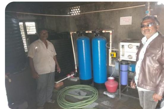
R.O Plants under “ Drinking Water Project ” in Tandur Constituency