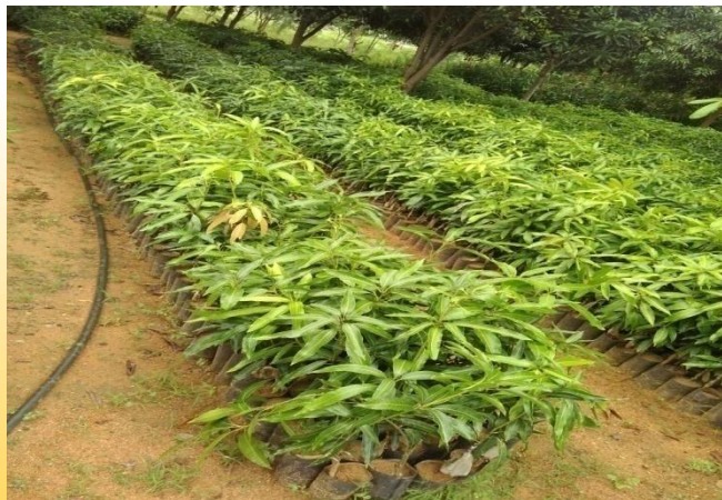
Raising of Fruit bearing Plants