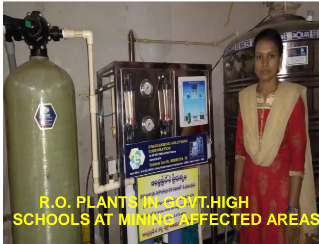
R.O. PLANTS IN GOVT.HIGH SCHOOLS AT MINING AFFECTED AREAS