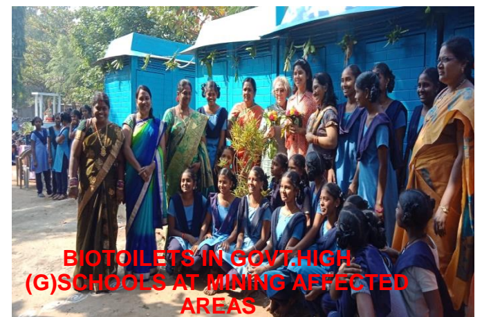
BIOTOILETS IN GOVT.HIGH (G)SCHOOLS AT MINING AFFECTED AREAS