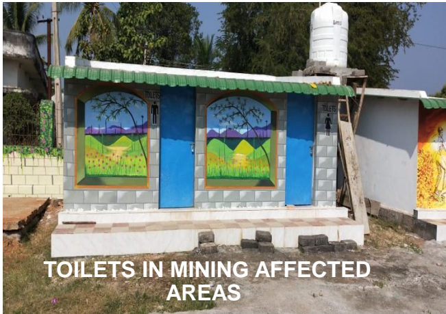
TOILETS IN MINING AFFECTED AREAS