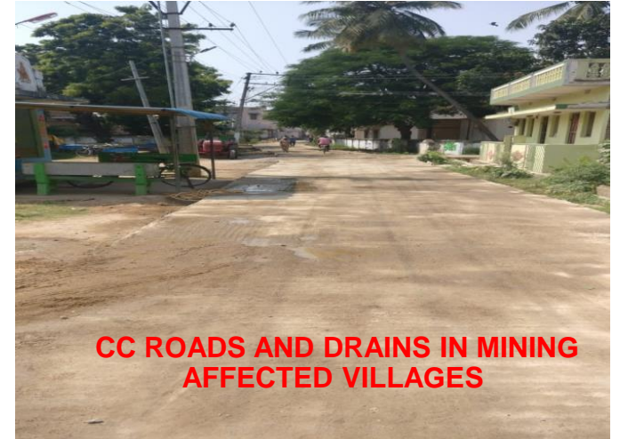
CC ROADS AND DRAINS IN MINING AFFECTED VILLAGES