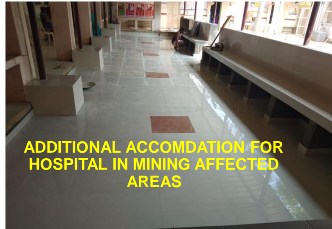
ADDITIONAL ACCOMMODATION FOR HOSPITAL IN MINING AFFECTED AREAS